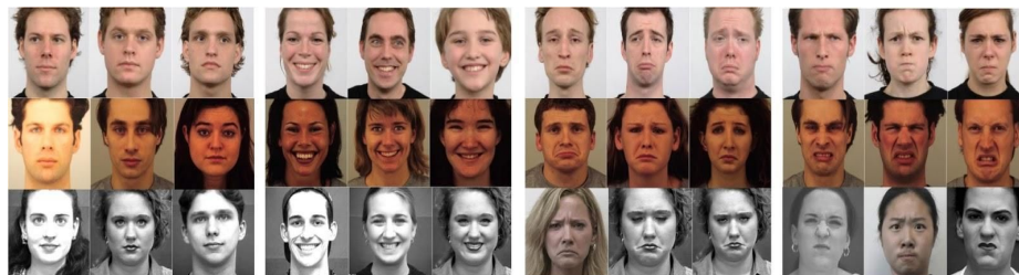
Fig. 1. Examples of targeted facial expressions during training. From left to right: Neutral, Happy, Sad and Angry. The training samples were collected from 3 different datasets. On top row Radboud [41], middle row KDEF [42] and on the bottom CK+ [43].

Training. Public data containing universal facial expressions of emotion is widely available, making possible the training of complex models capable of learning statistical relations between the morphology of the face and target classes. In "Fig. 1", a selected set of examples used to train our model are depicted.